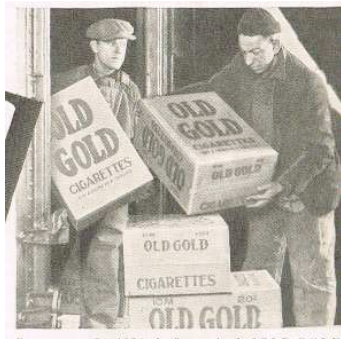
ON OCTOBER 24, 1926, the first carload of OLD GOLD reached the Pacific coast . . . endless trainloads have been going westward he ever since . . . with nar a cough in a carload.

A tip – smoke Old Gold Cigarettes and you won't be left with any irritation to your throat. They are made of better tobacco and are endowed by nature with a new taste-thrill. The first carload reached the west coast on October 24, 1926.